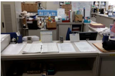
← Counter of the ICT Faculty Support Desk (Inside the Office of Environmental and Faculty Management ,1F Building 2)