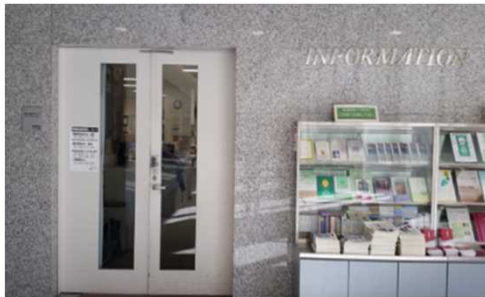
← Entrance of the ICT Faculty Support Desk (Inside the Office of Environmental and Faculty Management ,1F Building 2)

*Regarding rooms on Mejiro Seibo Campus, please consult with staff in Room 202, 2F, Building 1, Mejiro Seibo Campus.