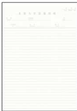
【Reaction Papers: B5, A4, B4】